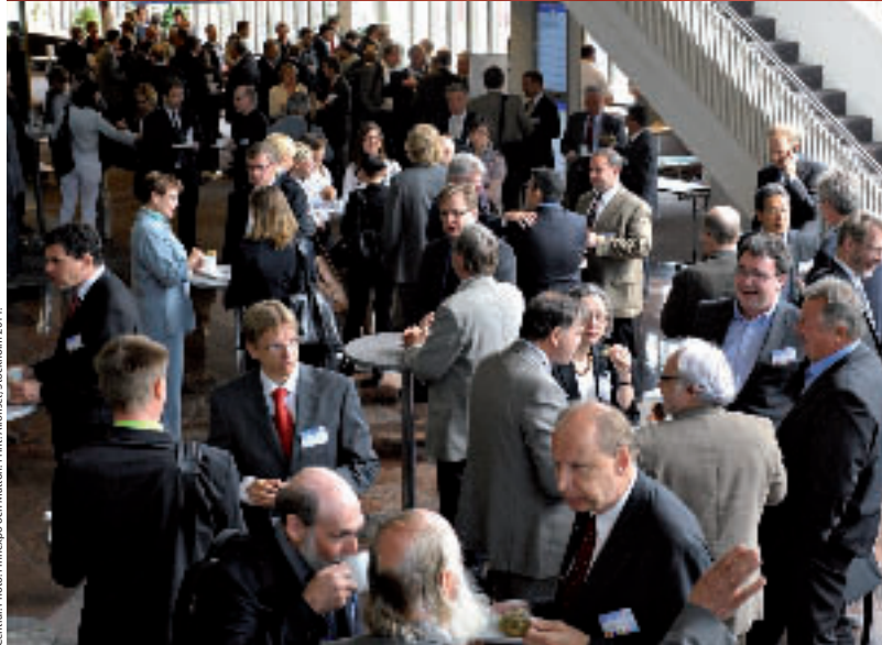
Central Photo: Finnexpo och Matton. Print: Alliefise, Stockholm 2011.

Return address: Adforum AB, FI-00521 Helsinki, Finland